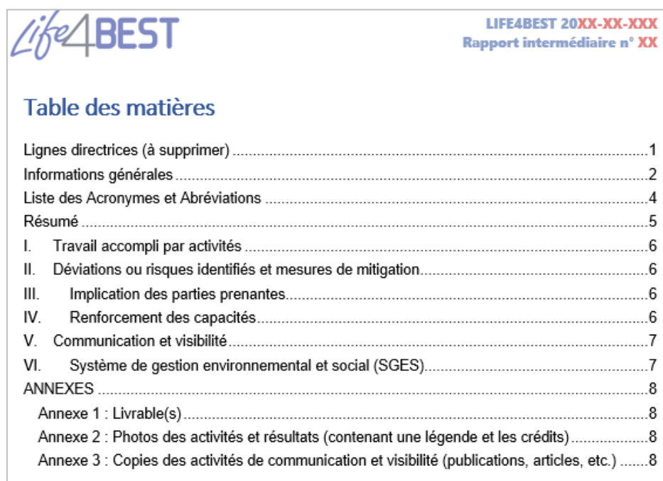
Figure 2: Interim report template - Table of content

In general, the reporting should present in a comprehensive manner the overall progress achieved for each activity planned and the impact of the project so far. It should also identify problems or difficulties encountered as well as measures taken or foreseen to overcome them and any changes to the initial plan .